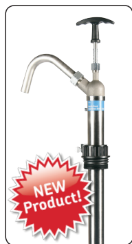
1390 Lift-action stainless steel pump Gift card value $15