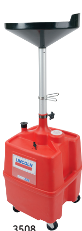
3508 Plastic oil drain — 8 gallon