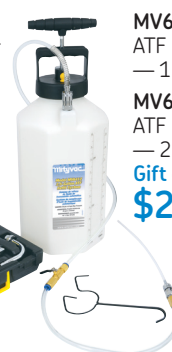
MV6410 ATF Refill system — 1 gallon