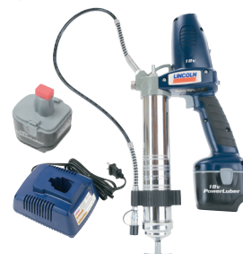
1842 18V Ni-Cd PowerLuber kit with 1 battery Gift card value $15