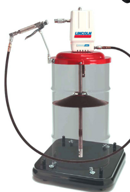
917 H.D. portable grease pump with drum platform base — #120