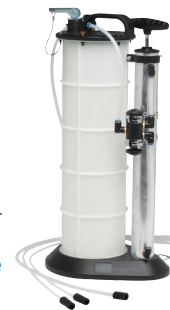
MV7201 Fluid evacuator plus Gift card value $10

REQUIREMENTS: Purchase one or more of the above models between July 1 and September 30, 2019