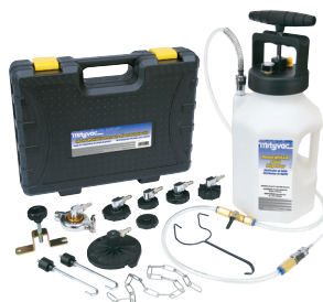
MV6840 Brake bleed system — pressurized Gift card value $30