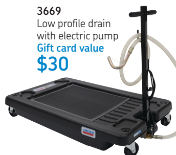
3669 Low profile drain with electric pump Gift card value $30