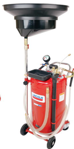
3639 H.D. used fluid combo drain / fluid evacuator Gift card value $40