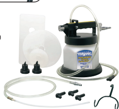
MV6830 Vacuum brake bleeder Gift card value $20