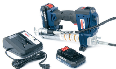
1882 20 V Li-Ion PowerLuber kit with 1 battery Gift card value $25